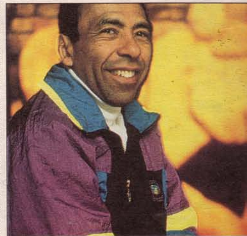
Angel Cordero, with three Kentucky Derby wins, wears his own