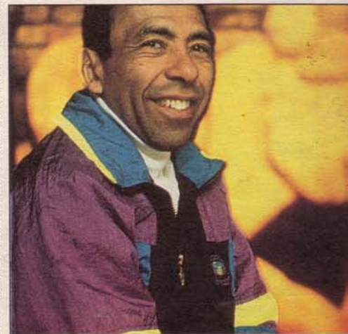
Angel Cordero, with three Kentucky Derby wins, wears his own jacket.